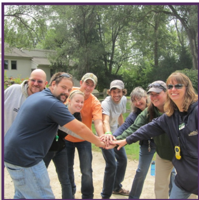
Our Incredible Staff

Recently, I sent a letter to our 100 plus staff emphasizing the impact they have in the lives of both animals and people and how the Howell Conference & Nature Center plays such an important role in our community. I'd like to share my thoughts with you.