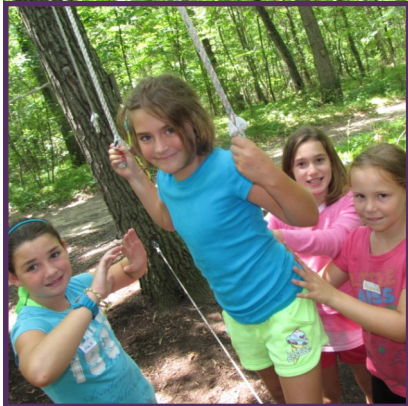
Summer Camp Fun